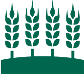
Food & Agro